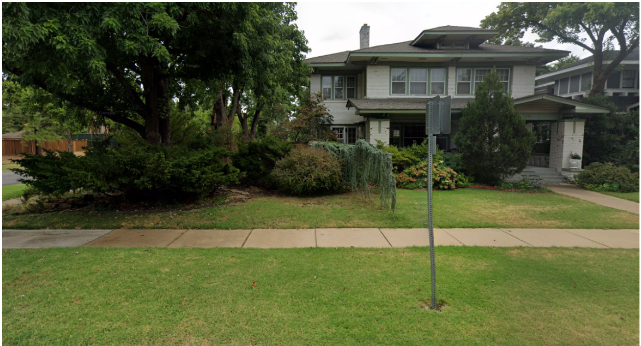
Google Maps – front façade looking south from NW 16 th Street