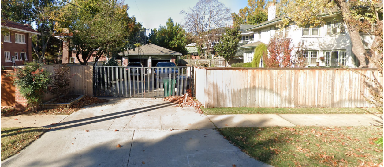
Google Maps – looking west into driveway and the site of the proposed pergola