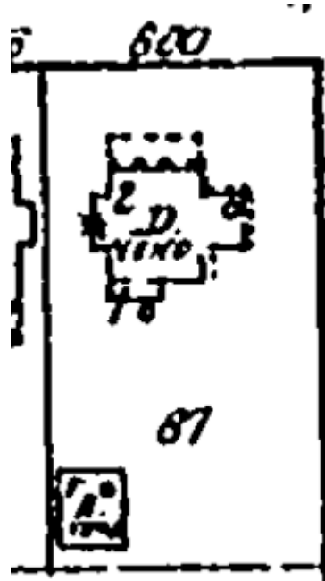
Sanborn Map, 1922-1955, Volume 2 - 1955, Sheet 221