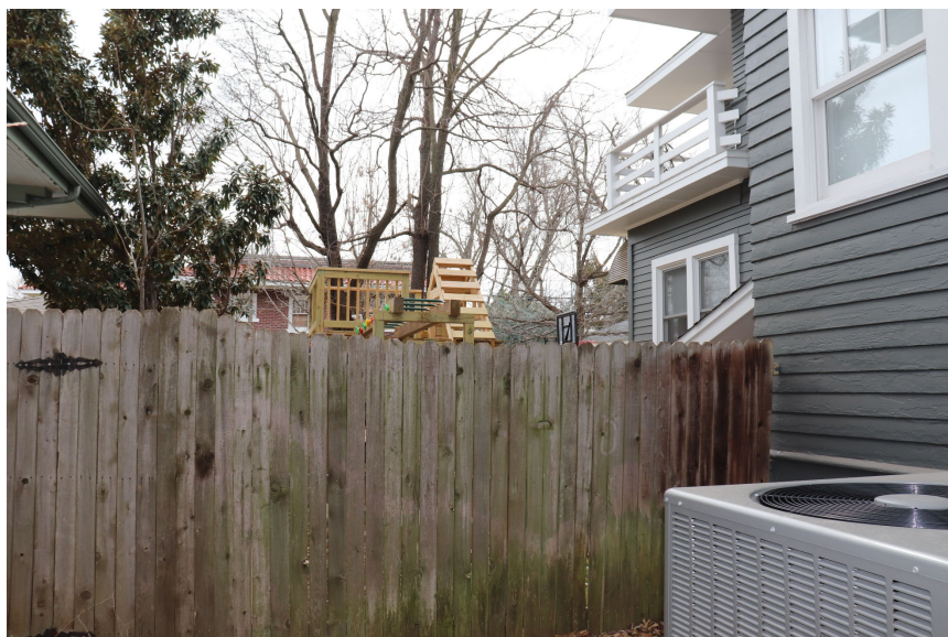
East Side Looking South Into the Rear Yard