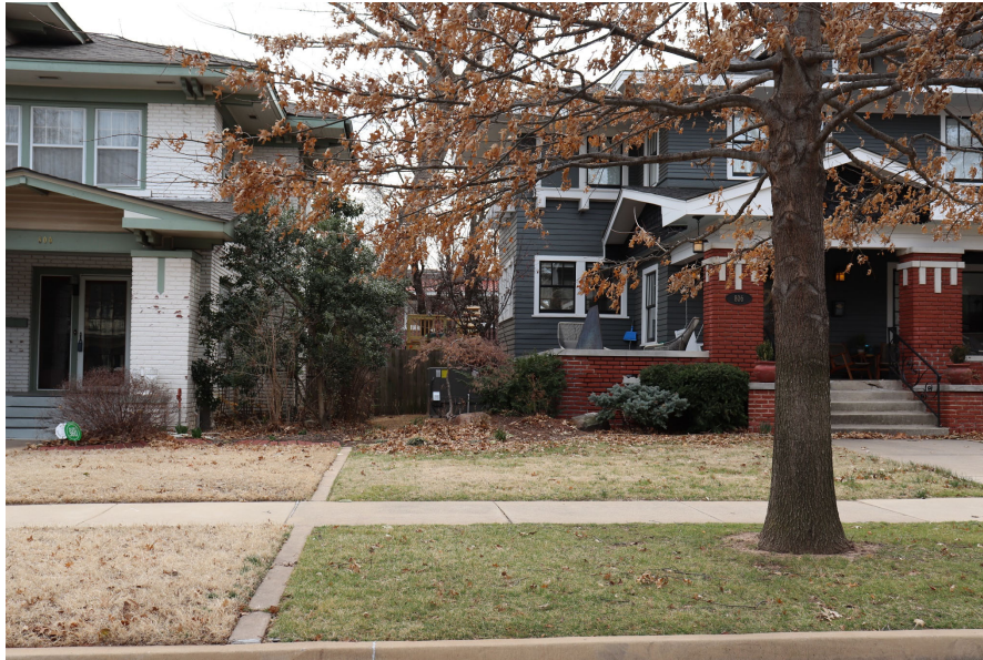
East Side Looking South