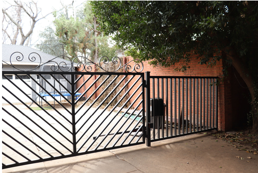
Looking South and West