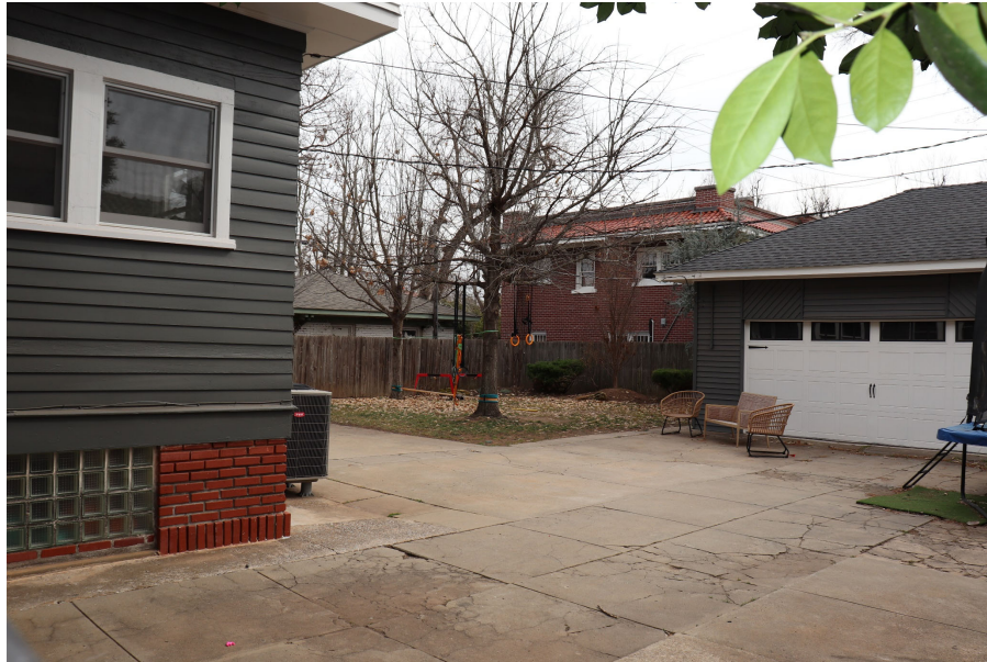
SE Corner of Yard