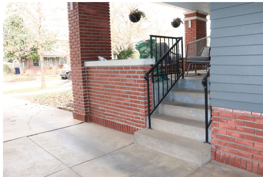
Paving Design Pattern Within Boundaries of the Porte-cochere