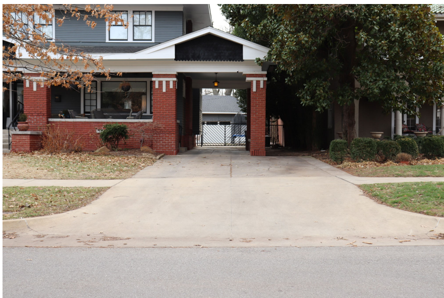
West Side Looking South at Expanded Driveway