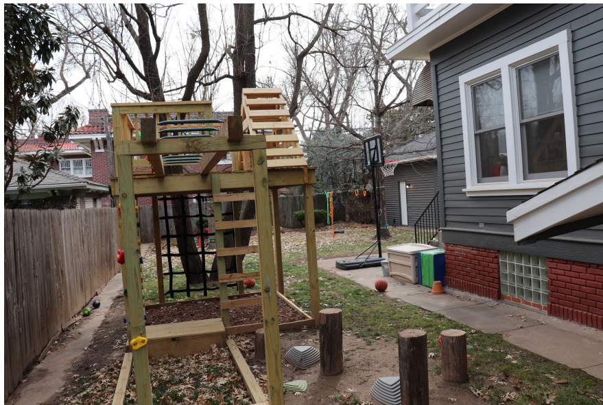
Looking South Along East Side to the Rear