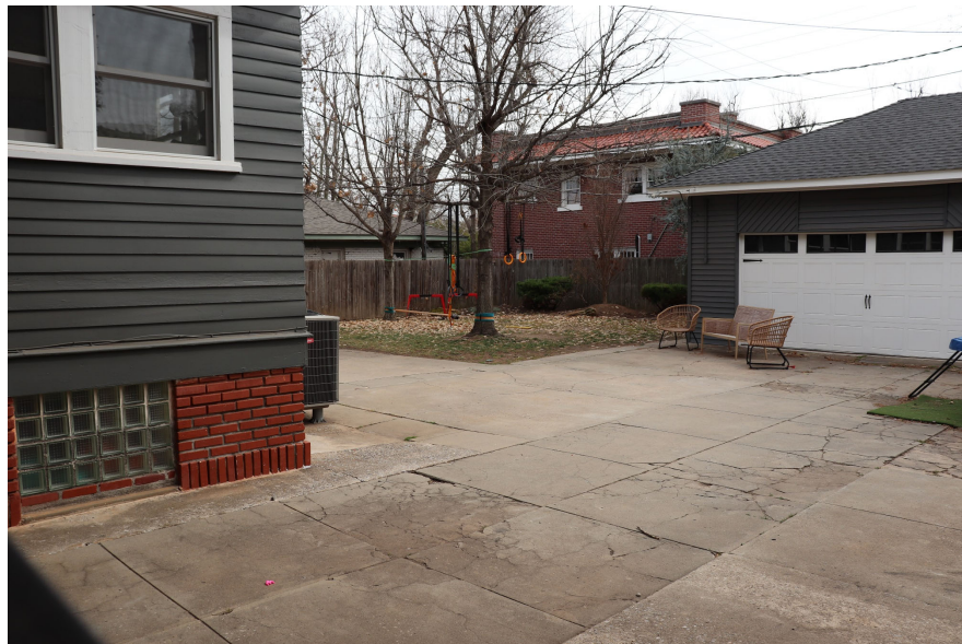
Looking South and East