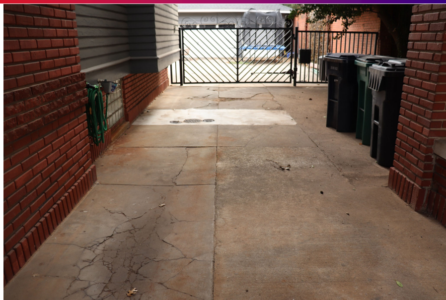
Looking South toward Garage in Back Yard