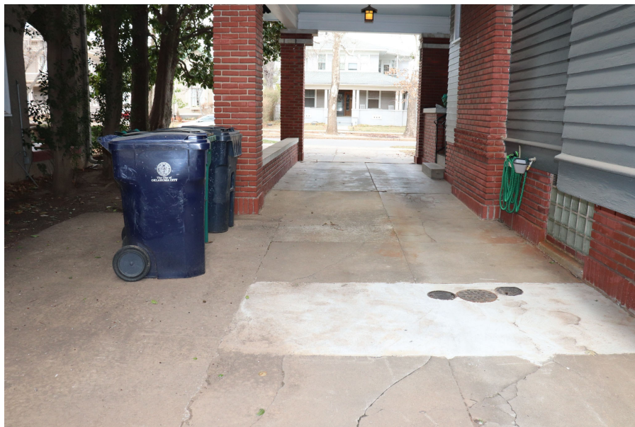
Looking North from the Driveway Gate