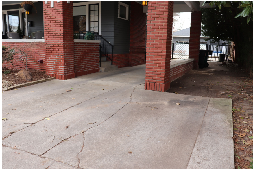
West Driveway with Expansions as Approaching the Porte-cochere