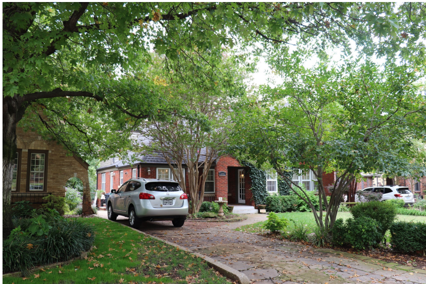
Driveway at East