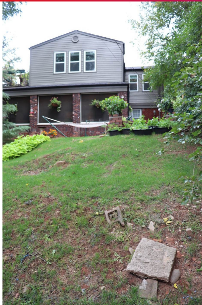
South Façade at Top of Slope