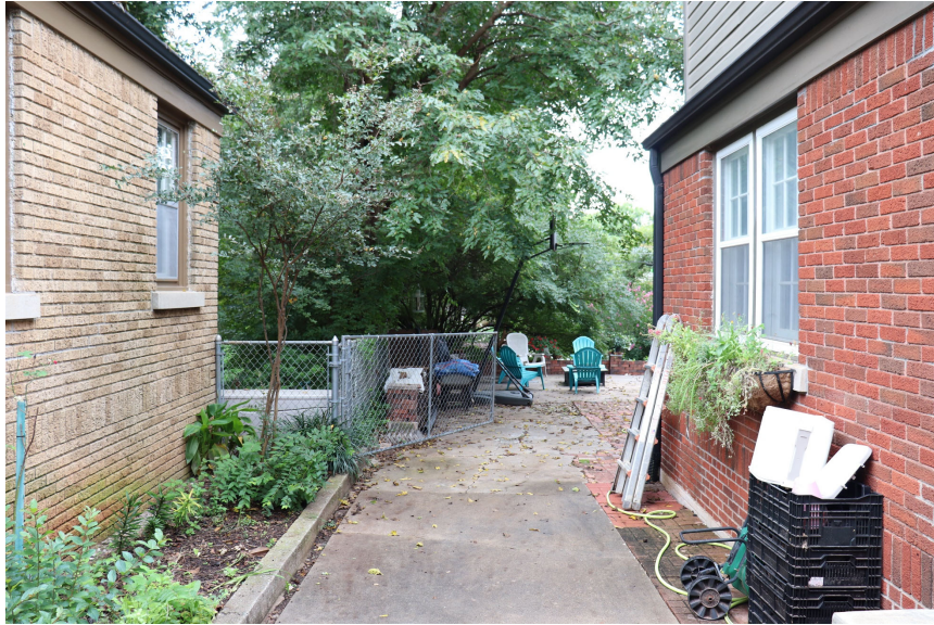
East Side of Dwelling