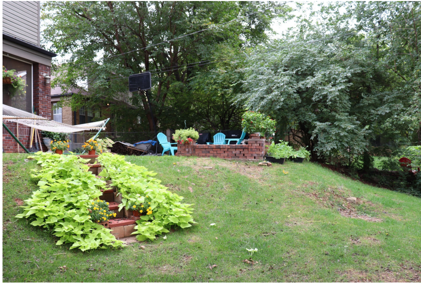
Looking North and West