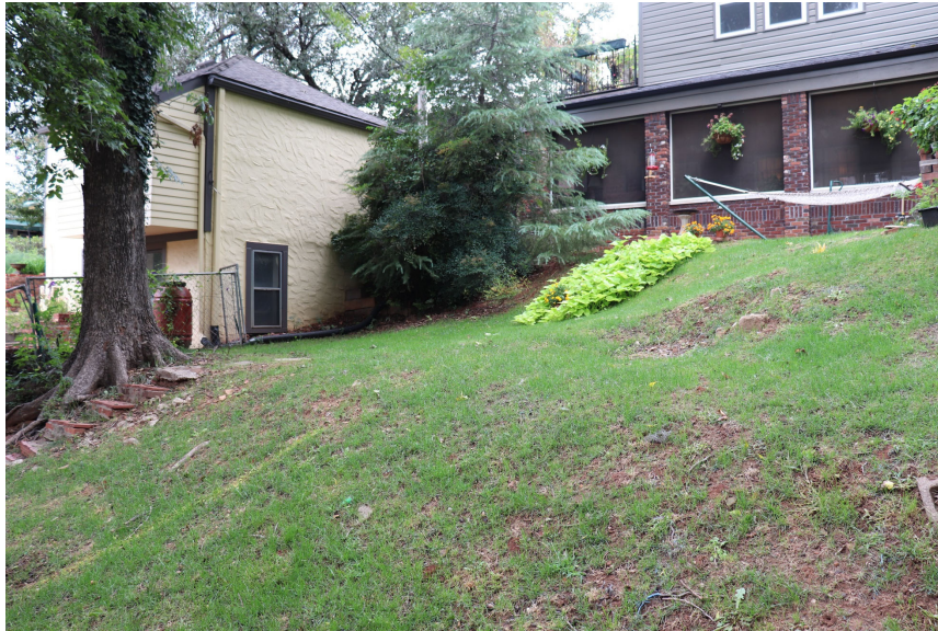
Looking North and West