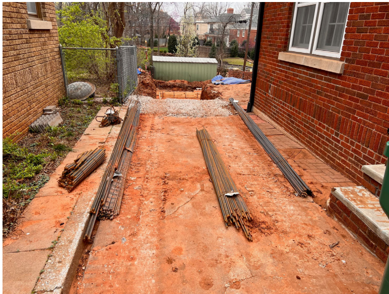
Looking South from Driveway