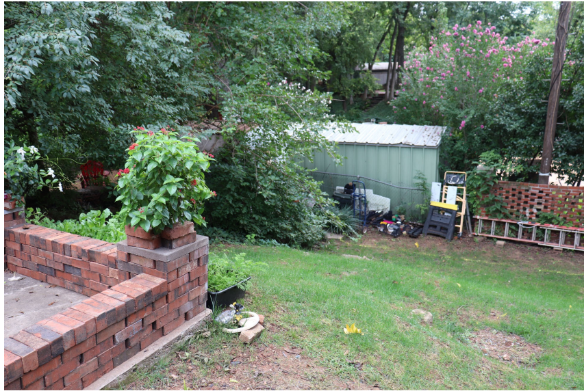
Looking South and East