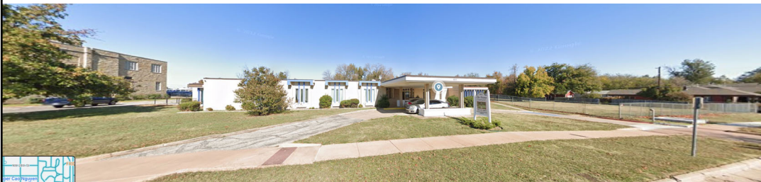
Existing Primary Building Looking North