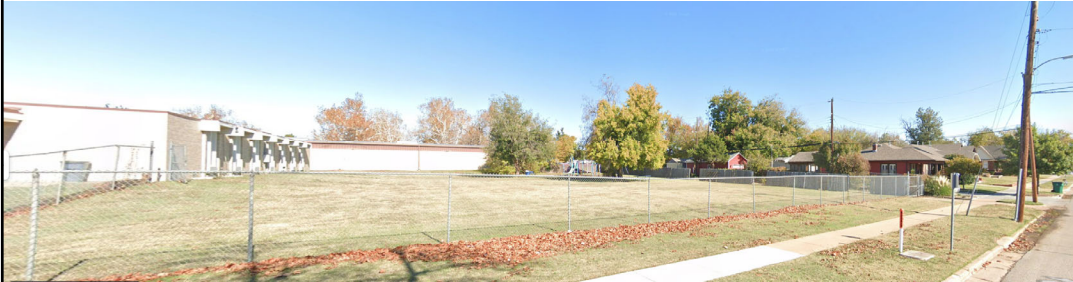
Warehouse Beyond Vancany