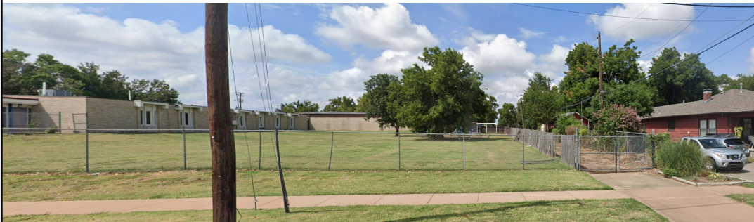
Warehouse and Vacant Site