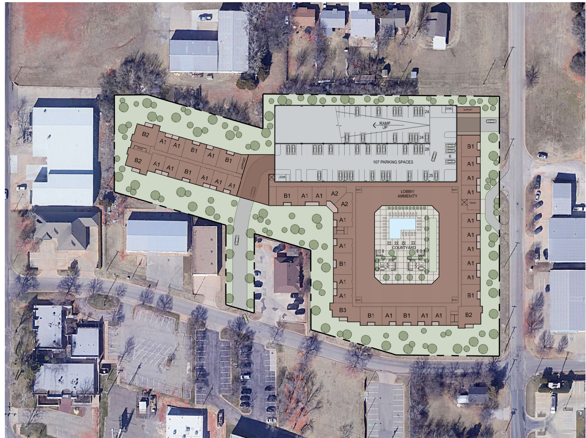
1st FLOOR / SITE PLAN 40 UNITS SCALE 1" = 100'-0"