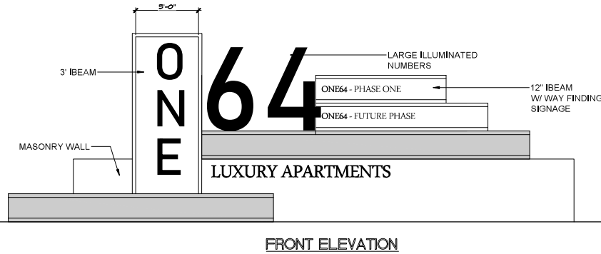
② ONE64 SIGNAGE - OPTION 2 SCALE: 1/2"=1'-0"