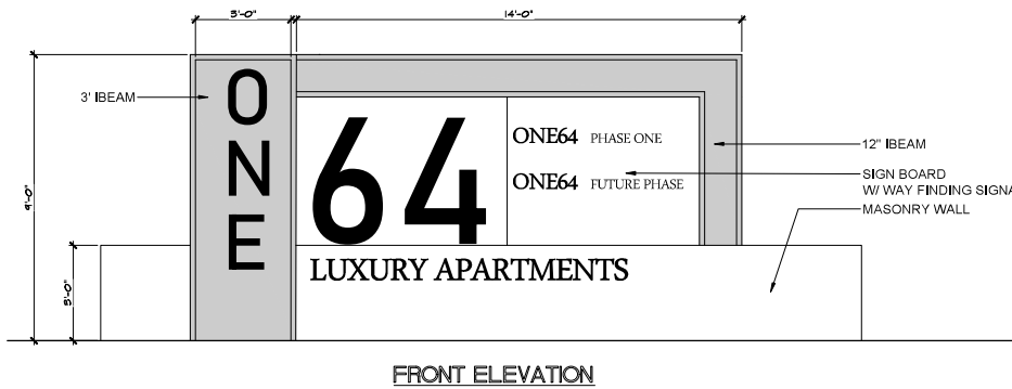
① ONE64 SIGNAGE - OPTION 1 SCALE: 1/2"=1'-0"