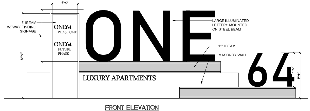
③ ONE64 SIGNAGE - OPTION 3 SCALE: 1/2"=1'-0"