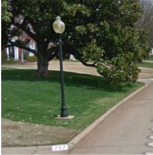
repeated light fixture at public rights of way along NW 38 th