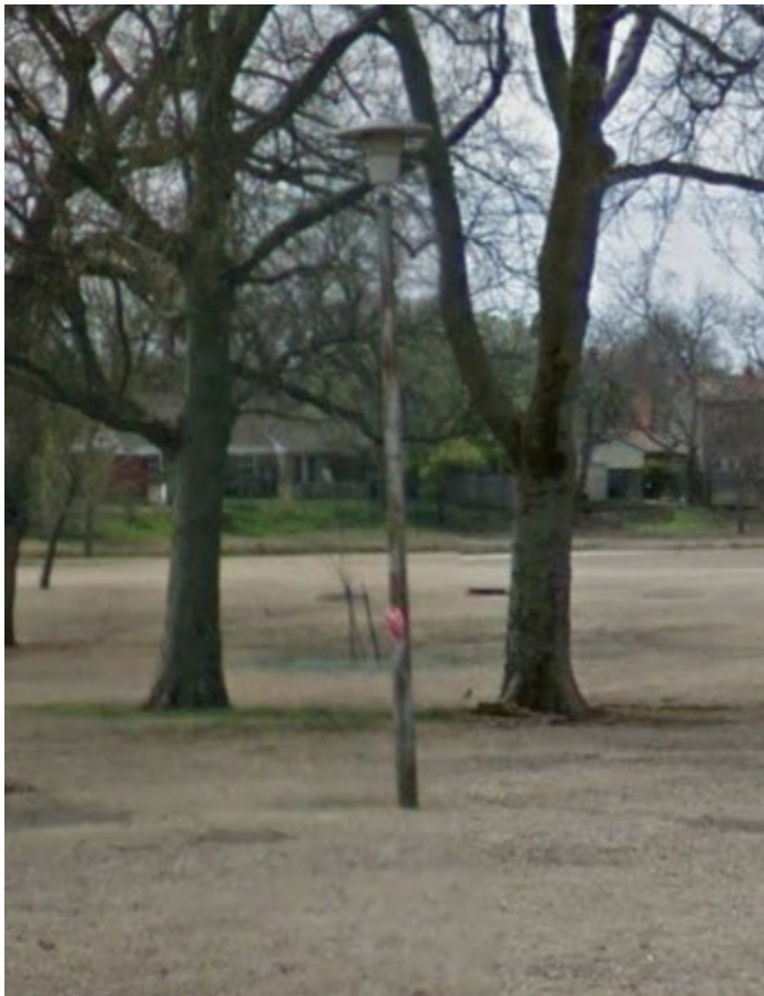
in the park