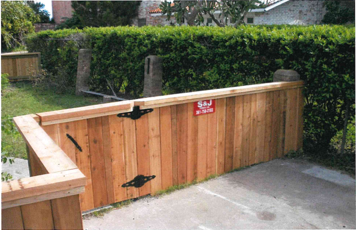
Example of fence