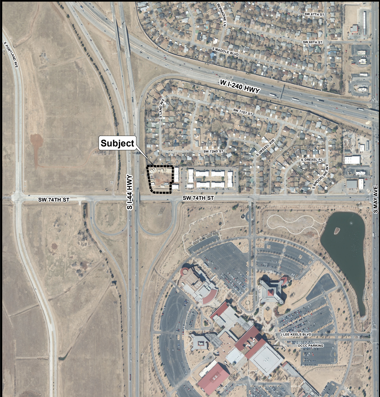
Aerial Photo from 2/2022