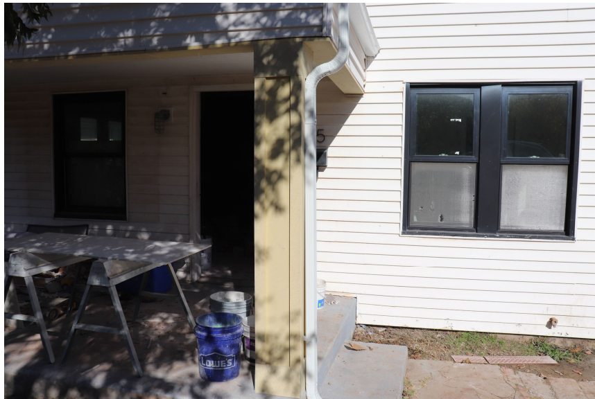
Front Porch Column