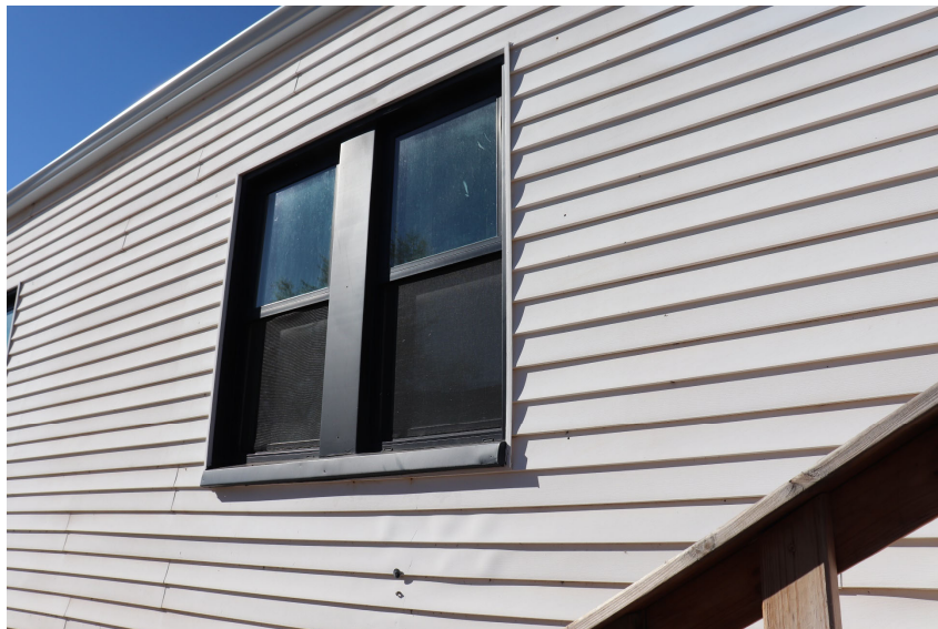
Window at East Elevation