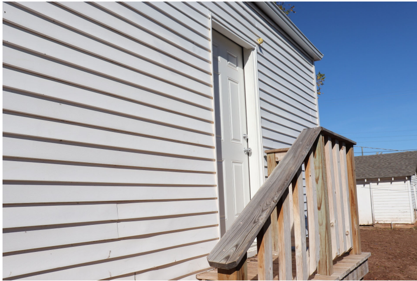
Side Door at East Elevation