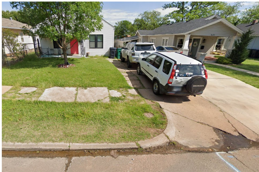
Driveway – Google Maps April 2024