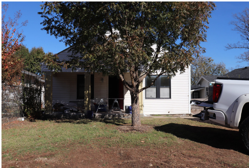
Front (South) Façade