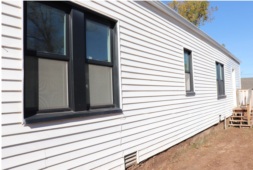
Windows at East Elevation