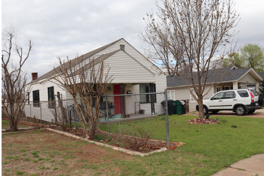
West Elevation from 3/24/2024