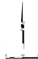
Exhibit B Tract Map