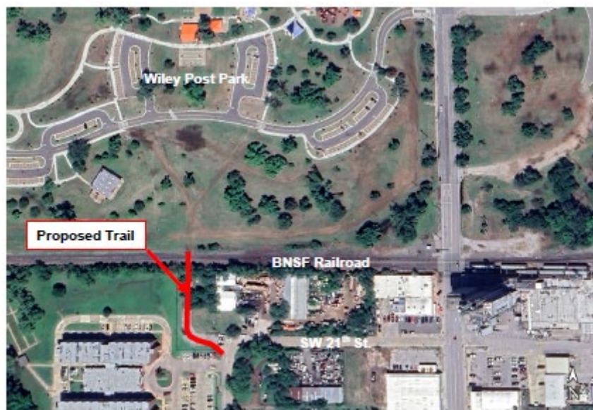
Project Location Map

The scope of services includes topographic survey, design of proposed trail connecting Wiley Post Park across the existing BNSF railroad tracks and wayfinding signage. See the location map below for the location of the proposed trail and railroad crossing.