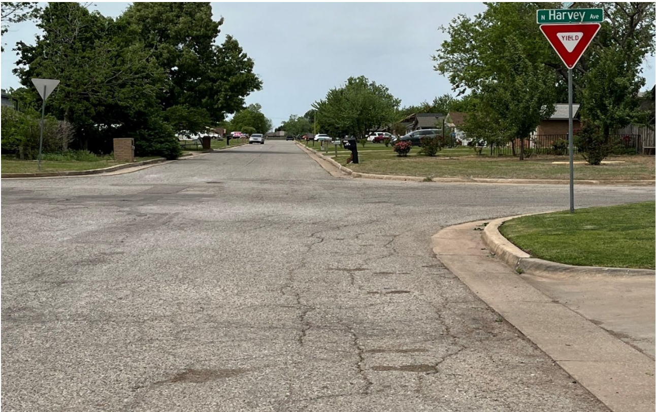
Looking west on NW 121 Street across N Harvey Avenue toward N Walker Avenue.