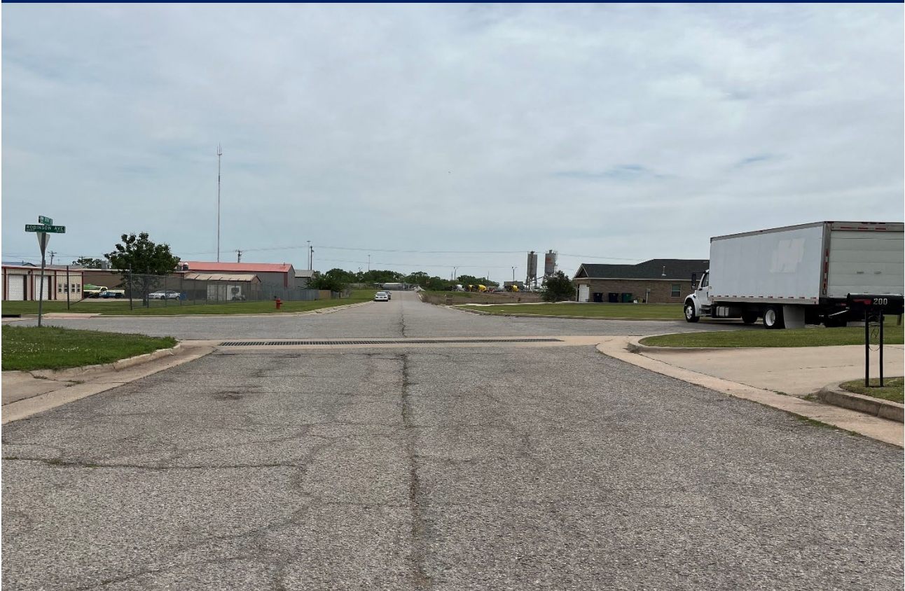
Looking east on NW 121 Street across N Robinson Avenue toward N Santa Fe Avenue. Note large single unit truck illegally parked in the intersection across what would be the south approach of N Robinson Avenue. Presently, N Robinson Avenue does not extend south from NW 121 Street.