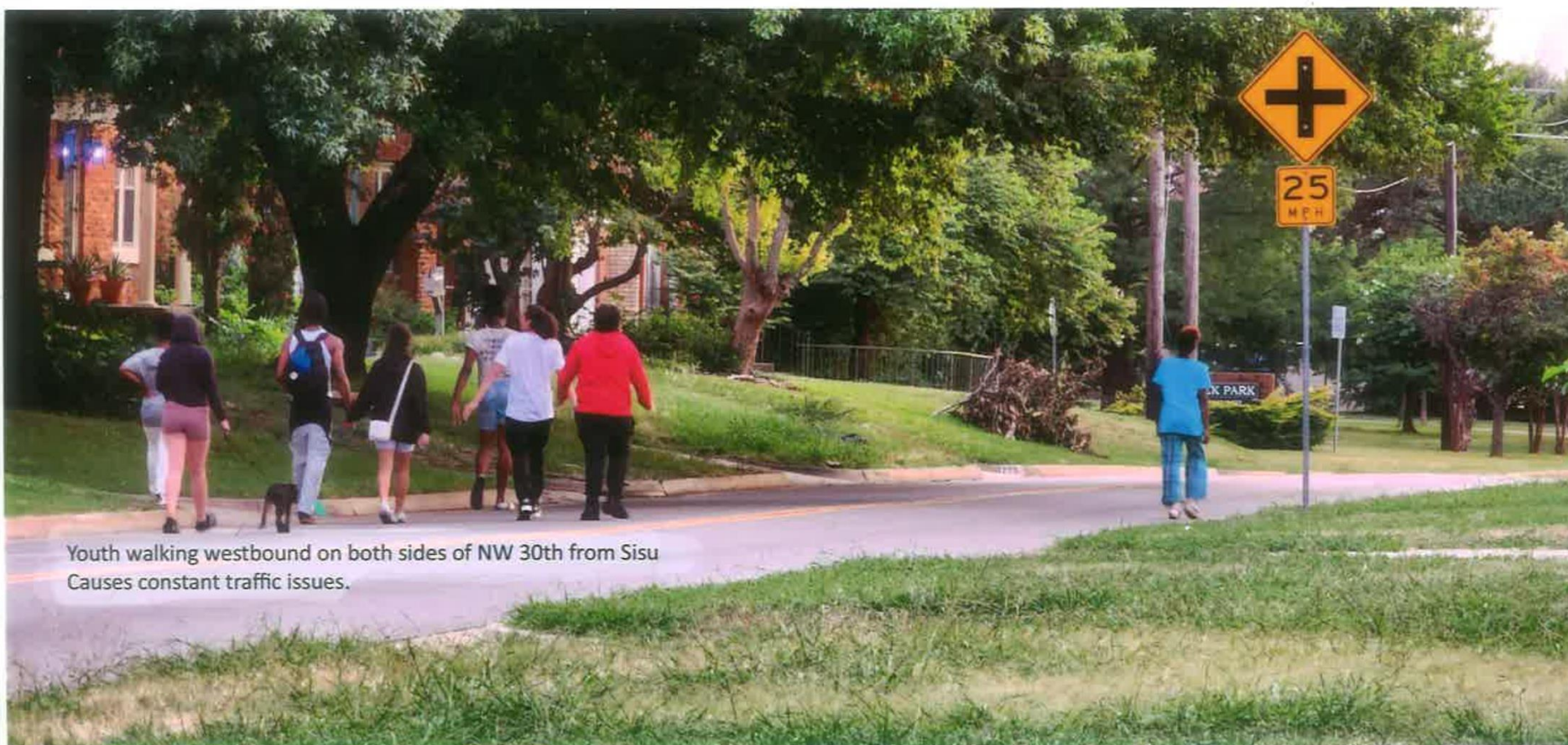
Youth walking westbound on both sides of NW 30th from Sisu Causes constant traffic issues.