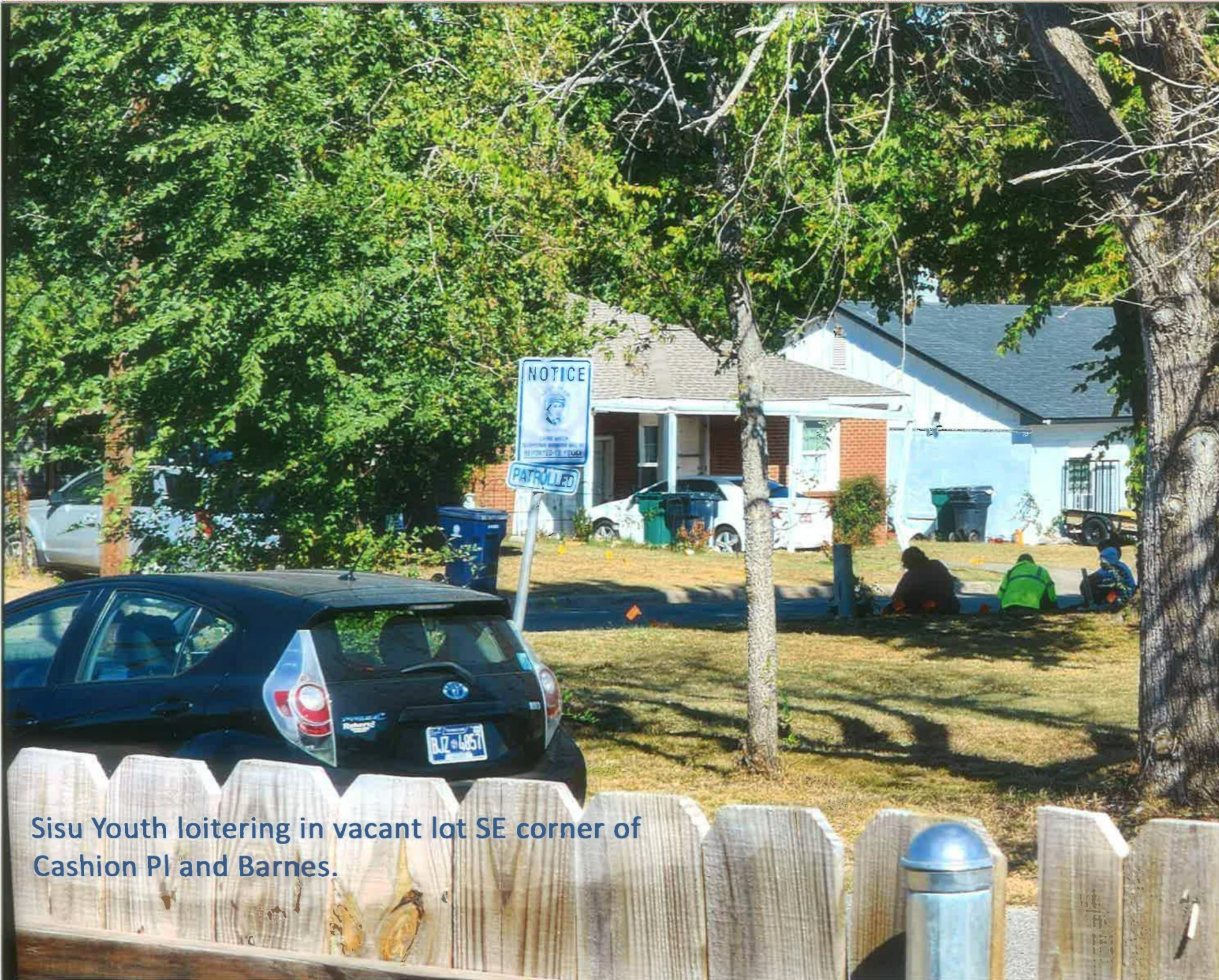
Sisu Youth loitering in vacant lot SE corner of Cashion Pl and Barnes.