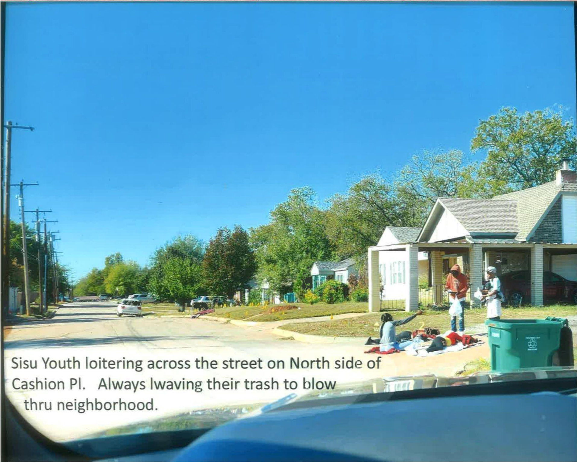
Sisu Youth loitering across the street on North side of Cashion Pl. Always lwaiving their trash to blow thru neighborhood.