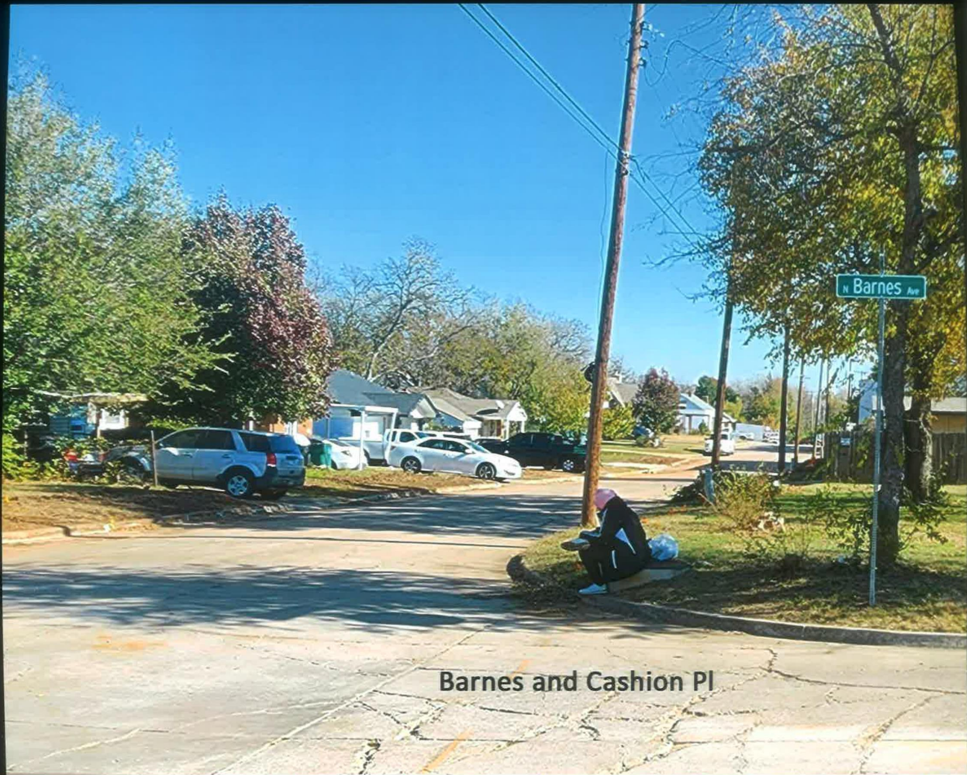
Barnes and Cashion Pl