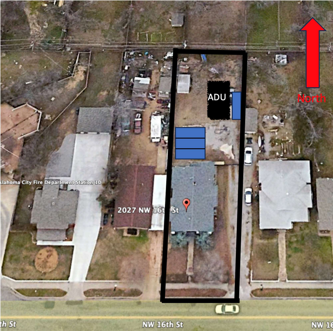
Exhibit B: Site Plan