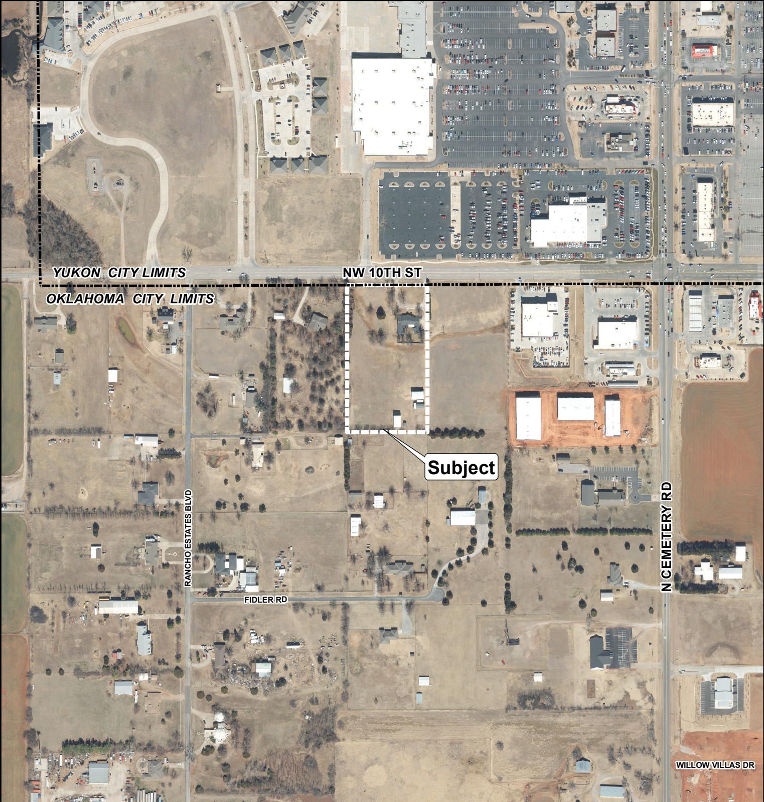
Aerial Photo from 2/2022

Case No: SPUD-1578 Applicant: YKOK, LLC Existing Zoning: AA Location: 13128 NW 10th St.