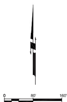
Exhibit B Tract Map