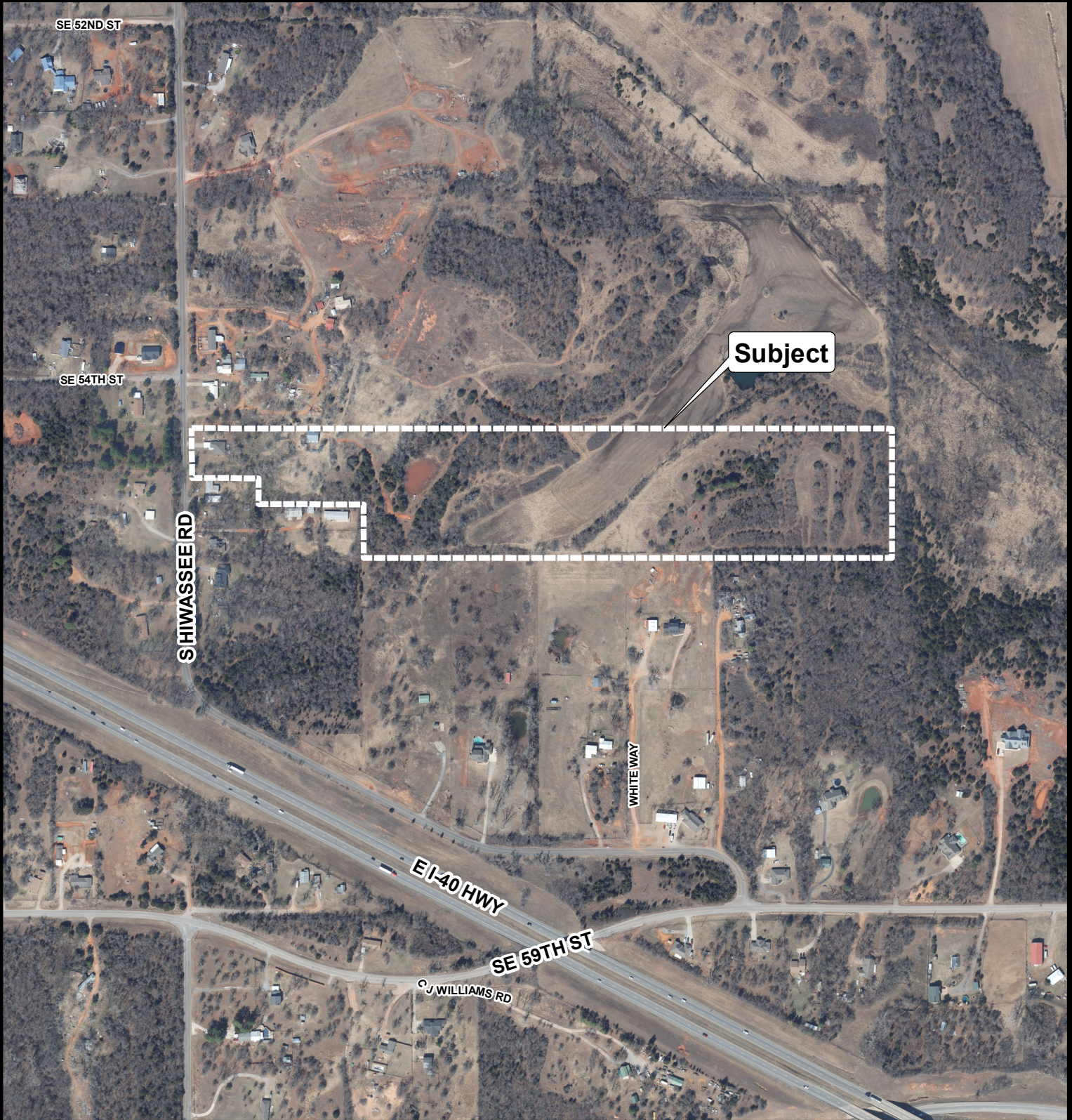
Aerial Photo from 2/2022

Case No: PC-10939 Applicant: BR Custom Homes, LLC Existing Zoning: AA Proposed zoning: RA2 Location: 5500 S. Hiwassee Rd.