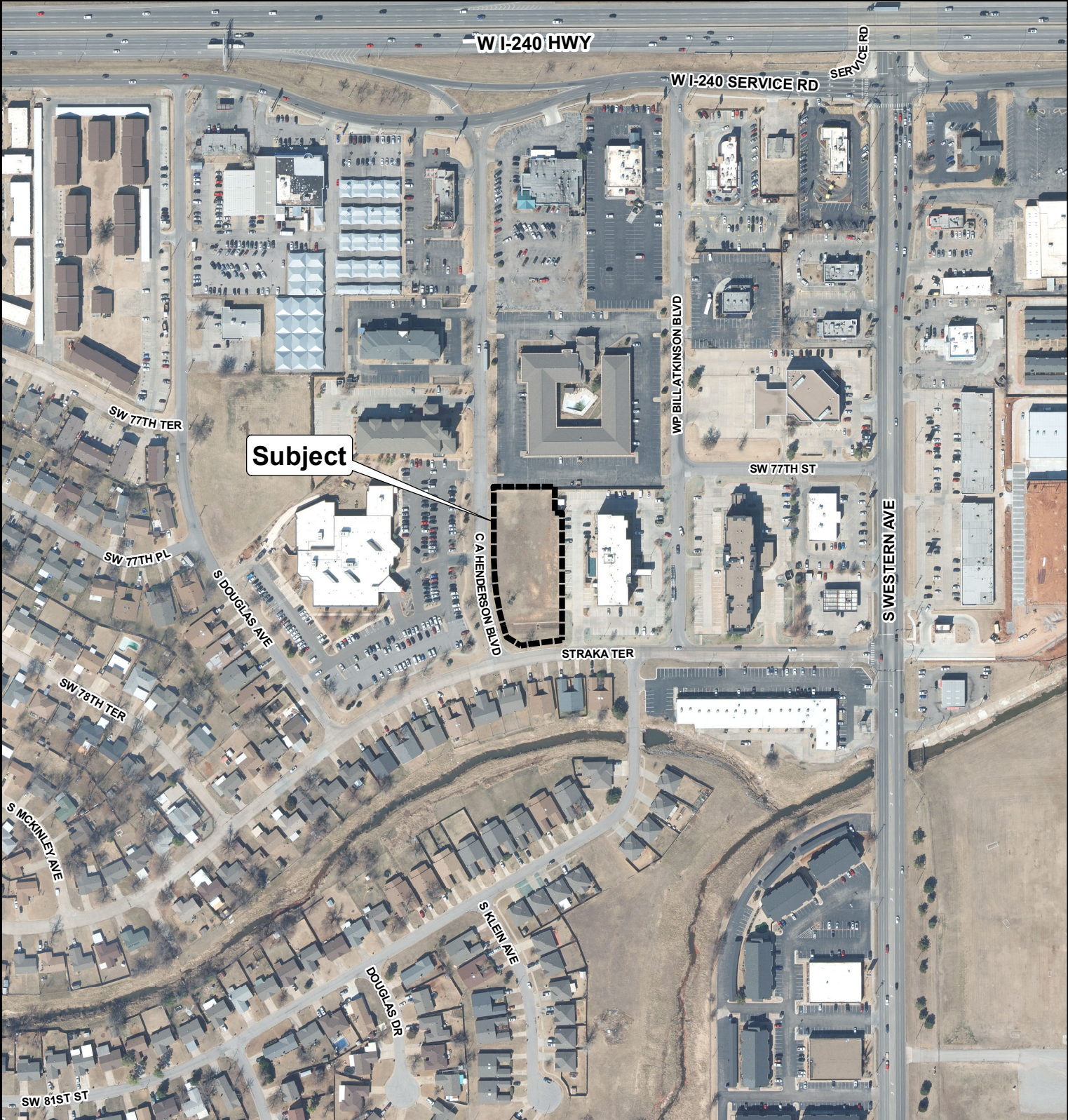
Aerial Photo from 2/2020

Case No: SPUD-1544 Applicant: Keshav, LLC Existing Zoning: C-3 / O-2 Location: 1021 Straka Ter.