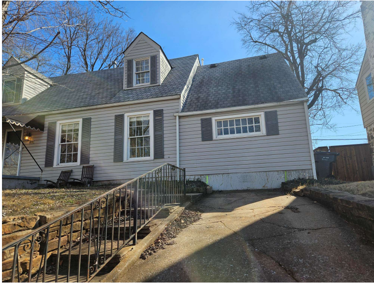
Driveway and Handrail