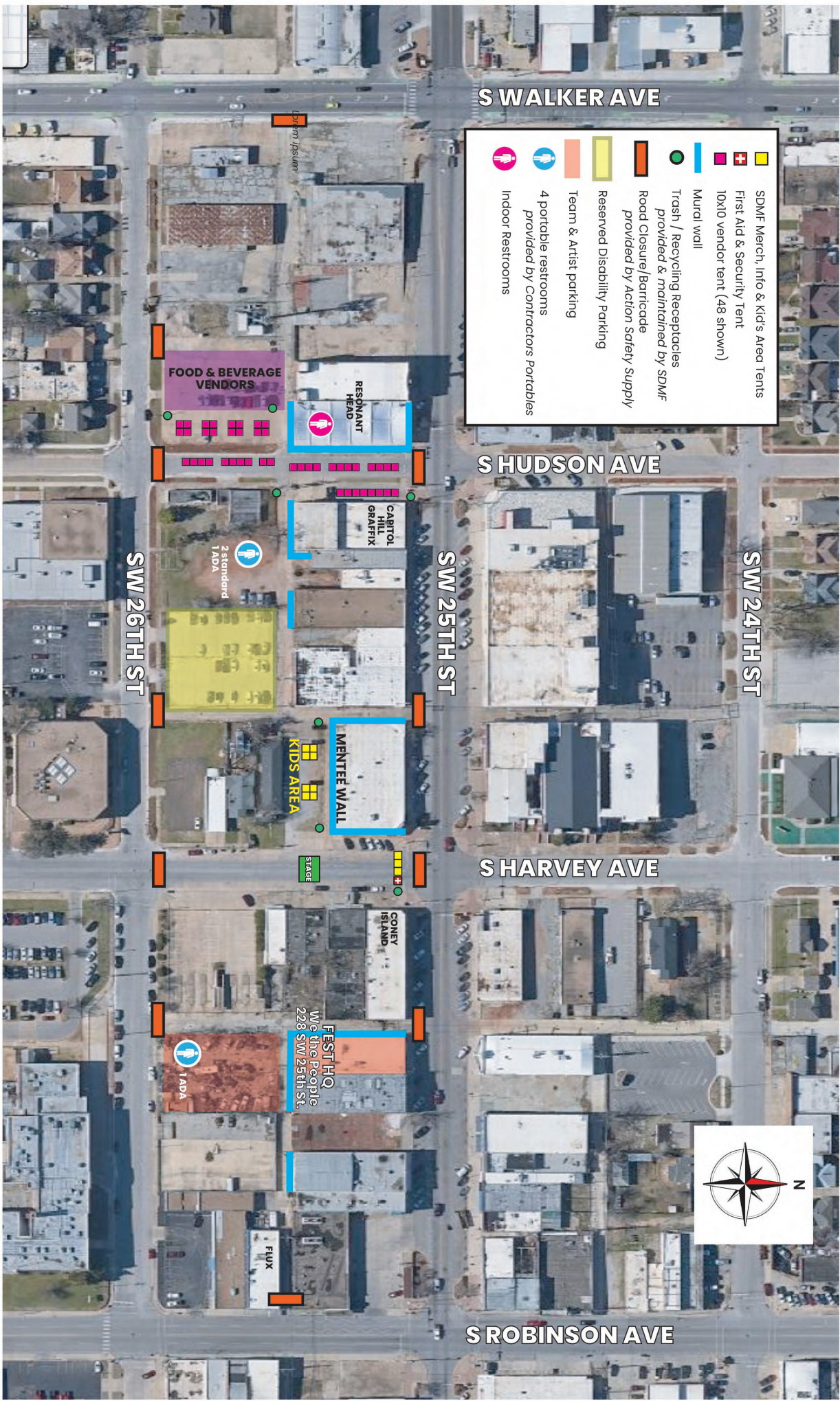
Sunny Dayz Mural Festival Site Map 5/31/2025