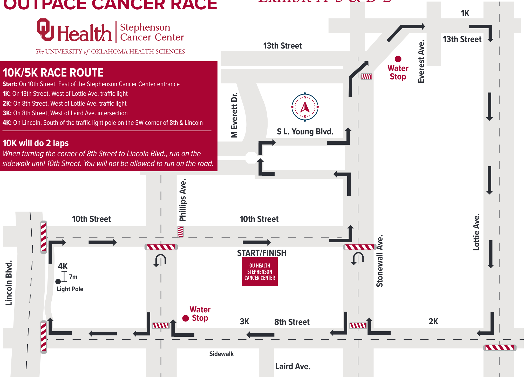
Exhibit A-3 & B-2

When turning the corner of 8th Street to Lincoln Blvd., run on the sidewalk until 10th Street. You will not be allowed to run on the road.