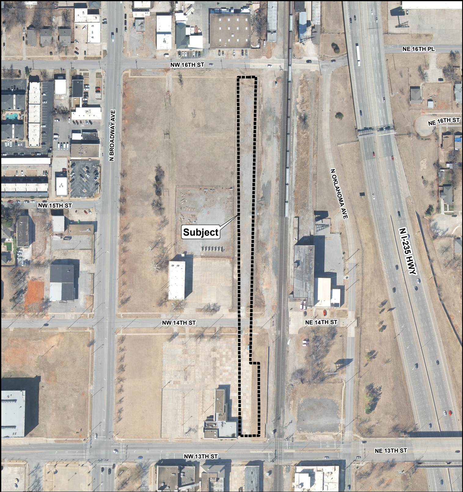
Aerial Photo from 2/2022

Case No: CE-1132 Applicant: OPERATIONREADYMIX, LLC & DOLESE BROS., CO.