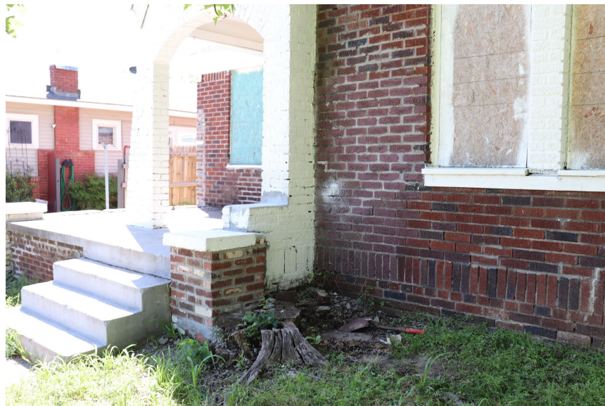
Front (North) Facade