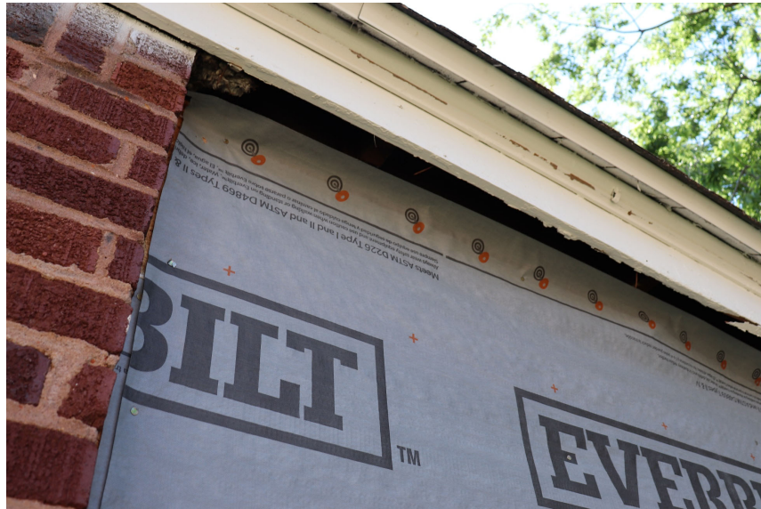
View of Deterioration Beyond Opening at West Elevation