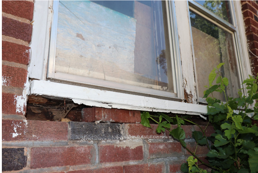
Windows and Storm Windows on West Elevation and Evidence of Deterioration Notice Original Mortar Joints Above and Various Repair Below