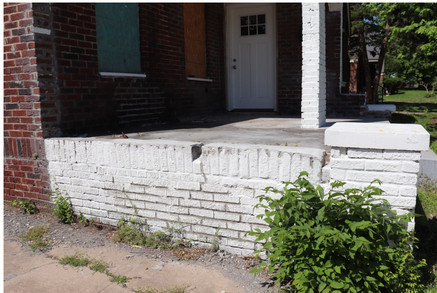
Front Entry; Notice Concrete Cap at Pier While Missing at Row