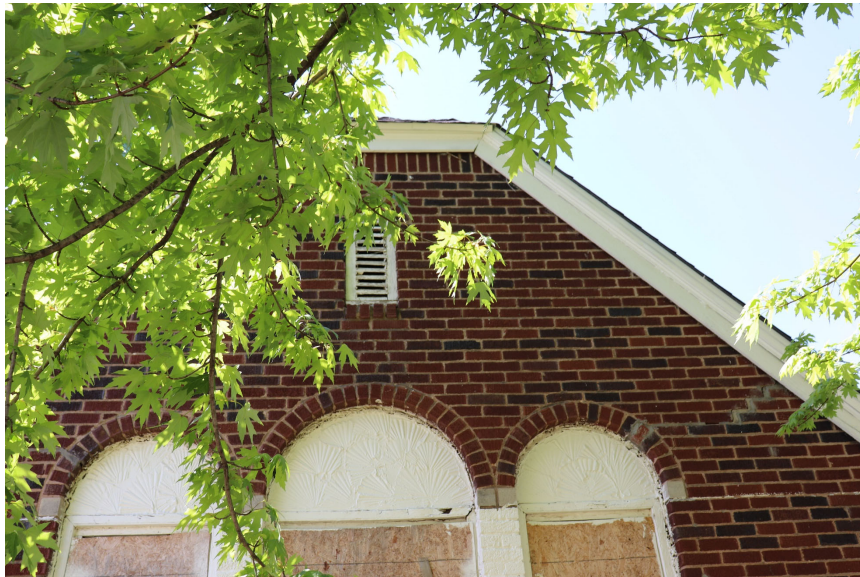
Front (North) Façade; Notice Methods of Brick Installation that Contribute to Architectural Detail