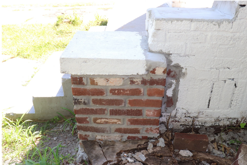
Front (North) Facade