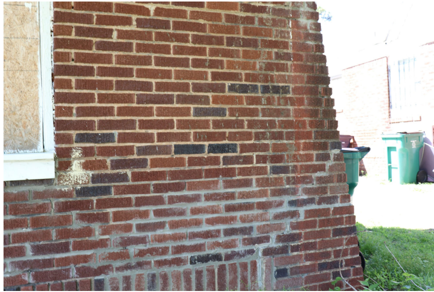
Front (North) Facade