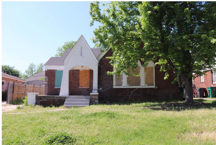
Front (North) Facade