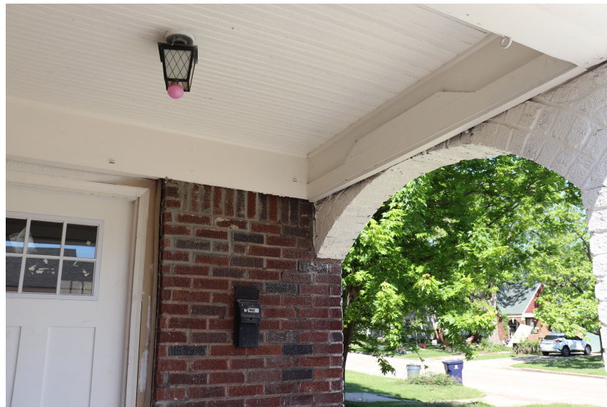
Front Entry; Notice Brick Details