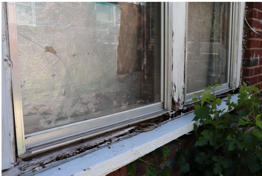
Deterioration and Wood Rot at Missing Windows on West Elevation