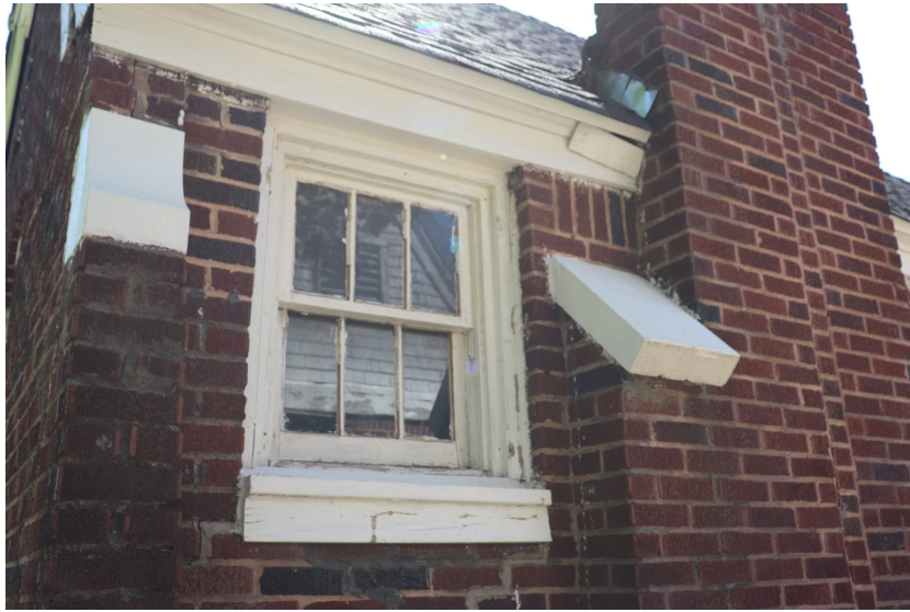
Wood Window on West Elevation