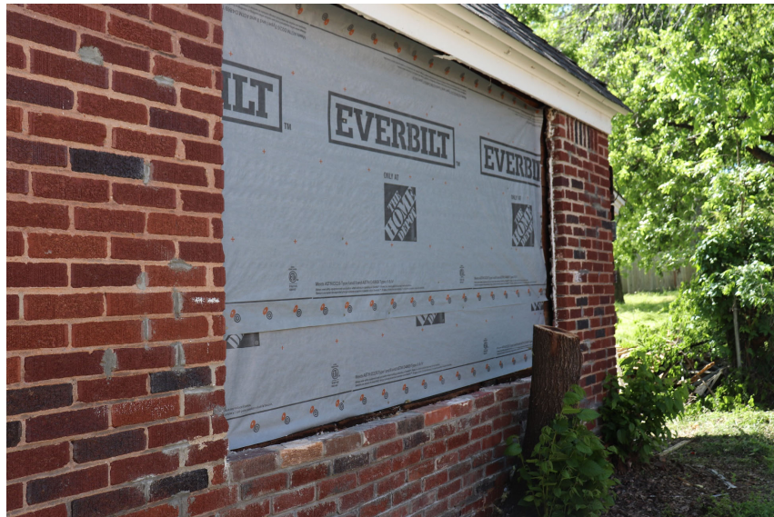
Window Set Opening at West Elevation and Various Joint Repair