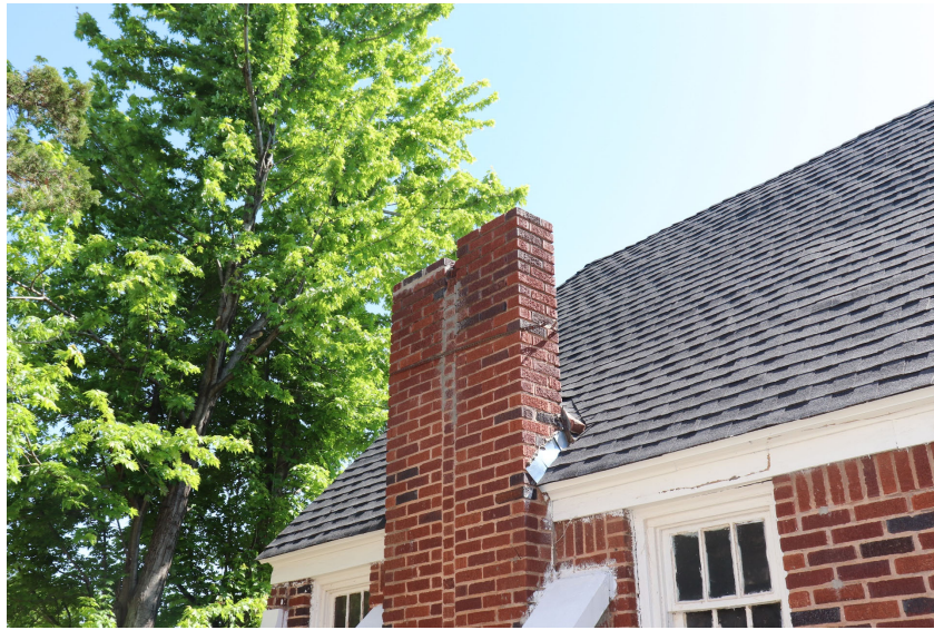
West Elevation – chimney