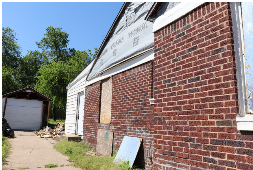
East Elevation, Notice Various Repointing