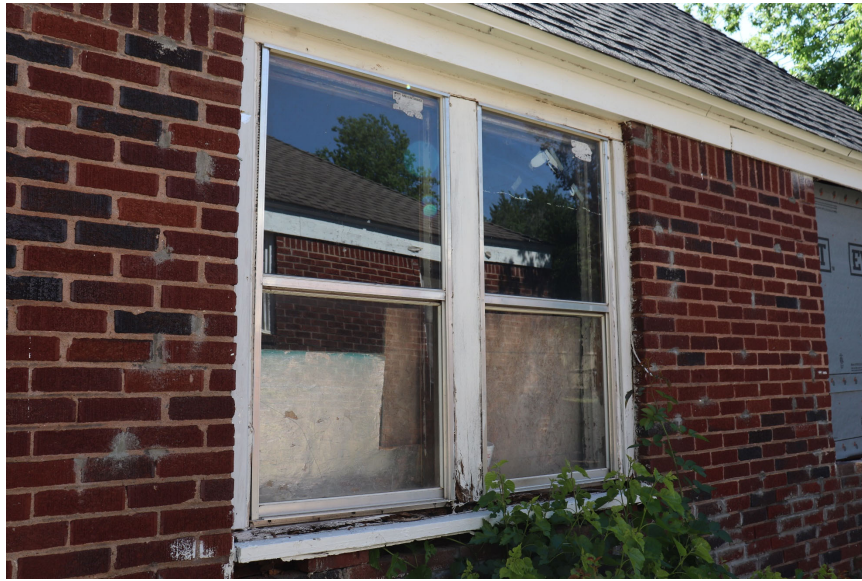
Metal Storm Windows on West Elevation