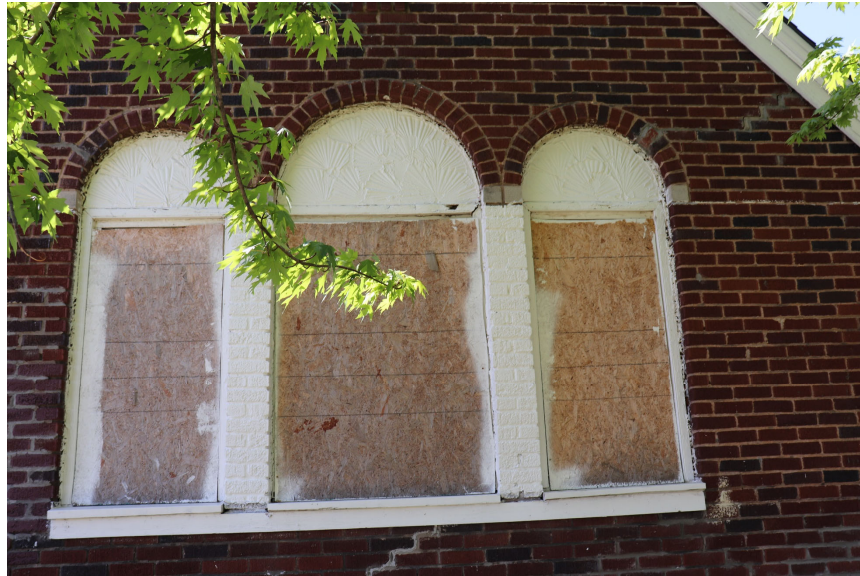
Front (North) Facade