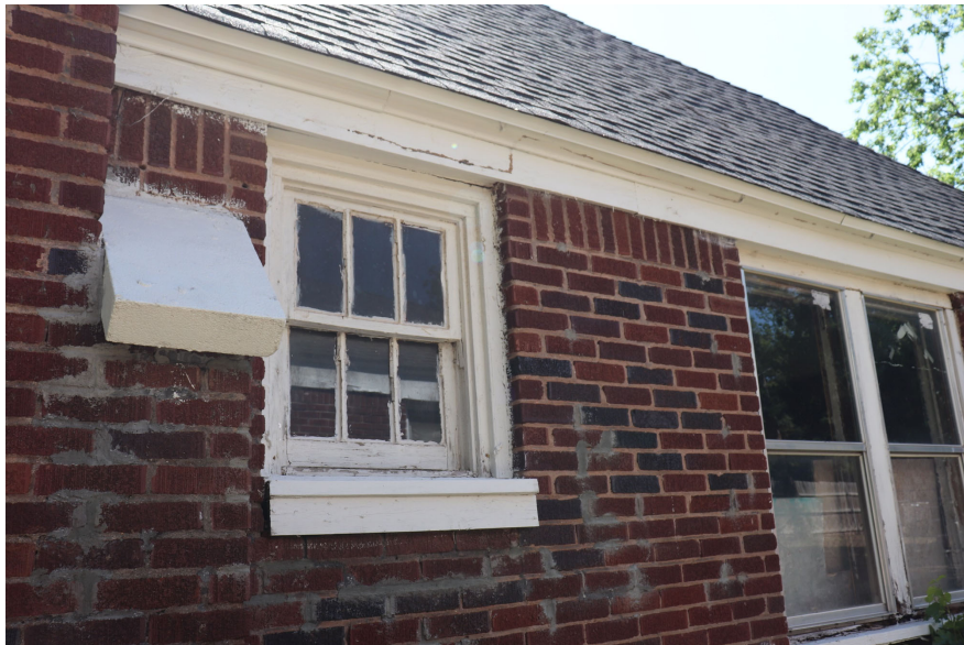
Wood Window on West Elevation