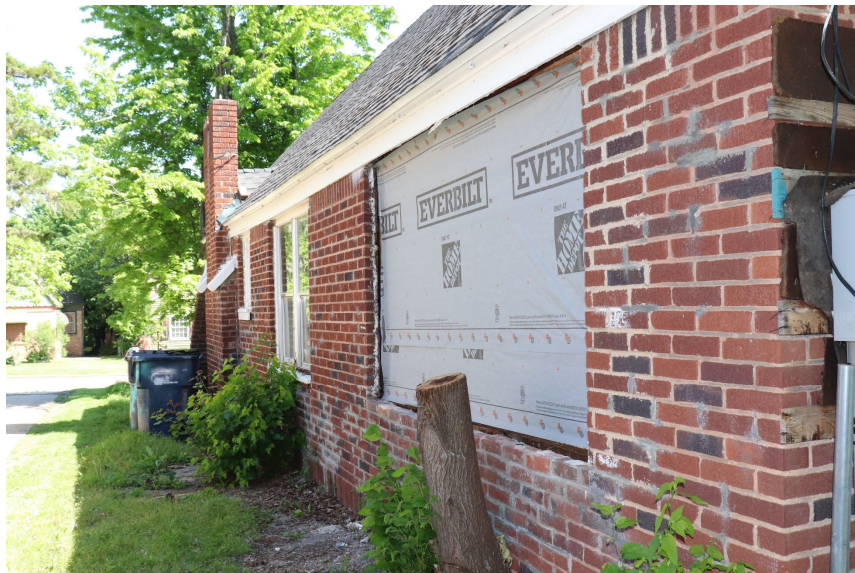
West Elevation Looking North