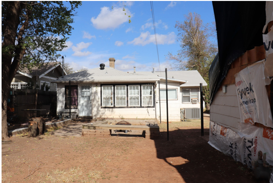
Rear of Primary Structure