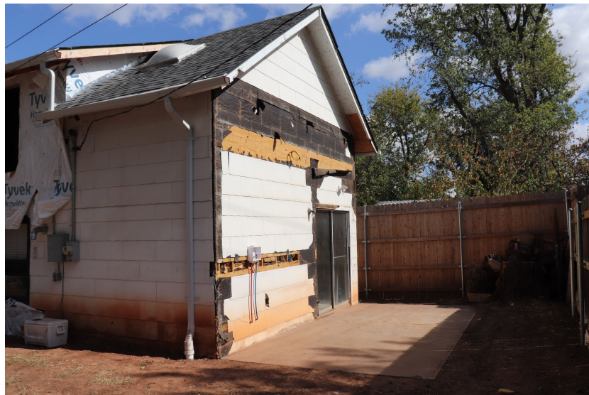
Accessory Structure South End