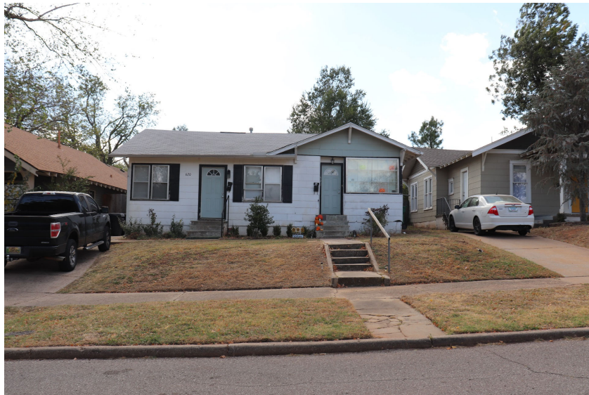
Front (North) Façade