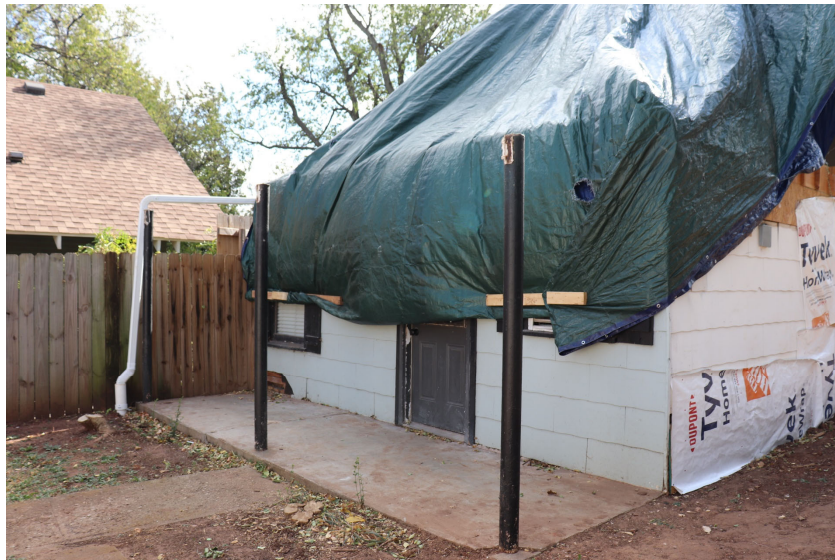
Accessory Structure NW Corner