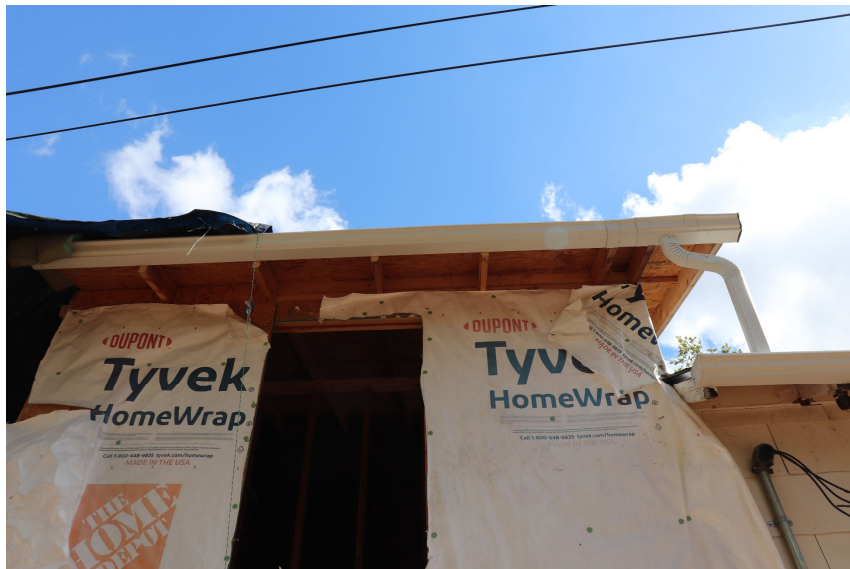
Accessory Structure West Side Proposed Window Location