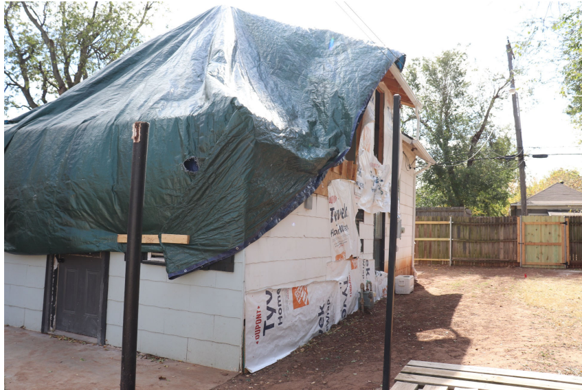
Accessory Structure Looking South along the West