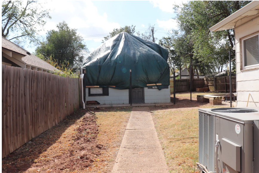
Accessory Structure North