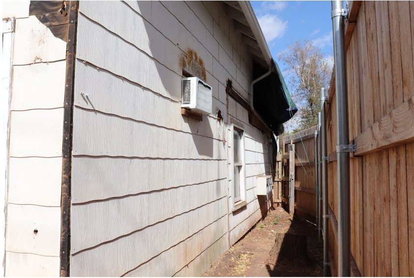
Accessory Structure Looking North along East Facade