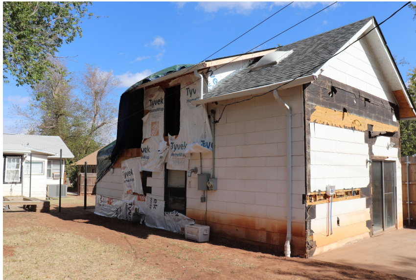
Accessory Structure SW Corner