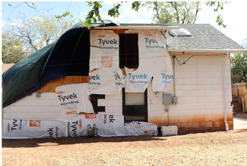
Accessory Structure West Elevation