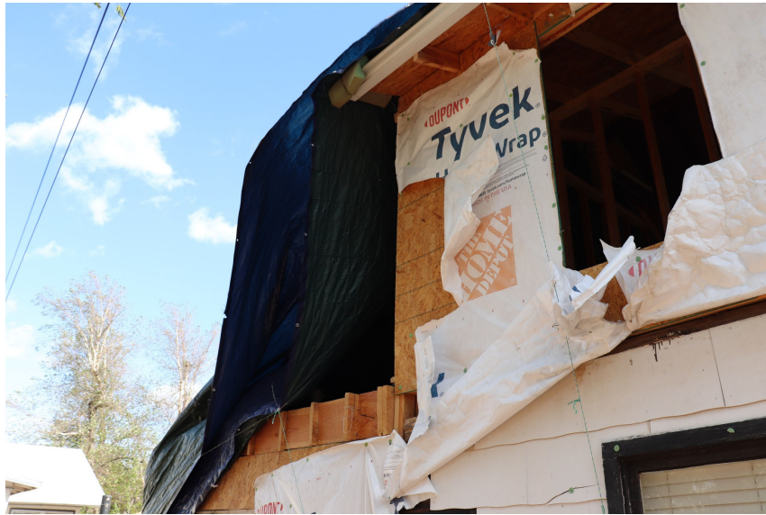
Accessory Structure Balcony Area at North End and Possible Wall Height Increase