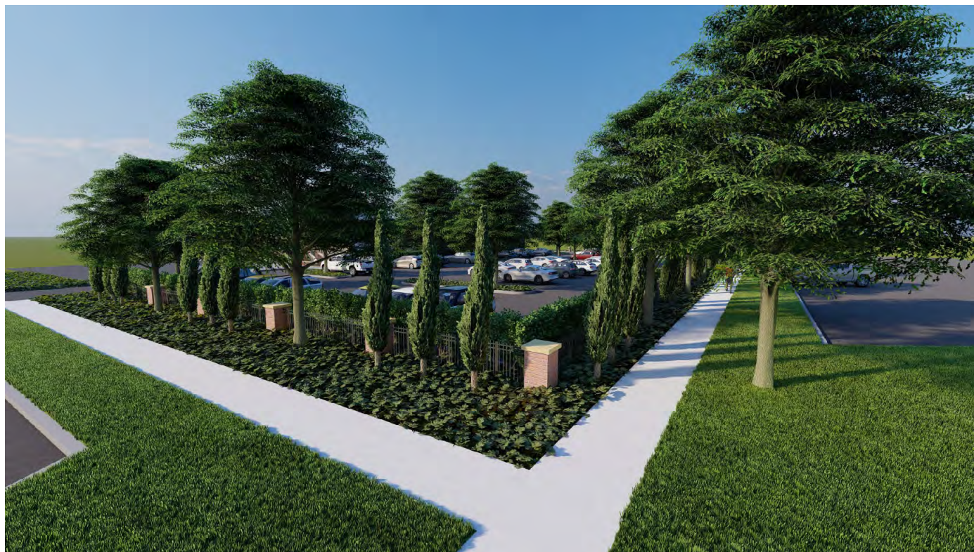
Exhibit D Conceptual Landscape Renderings