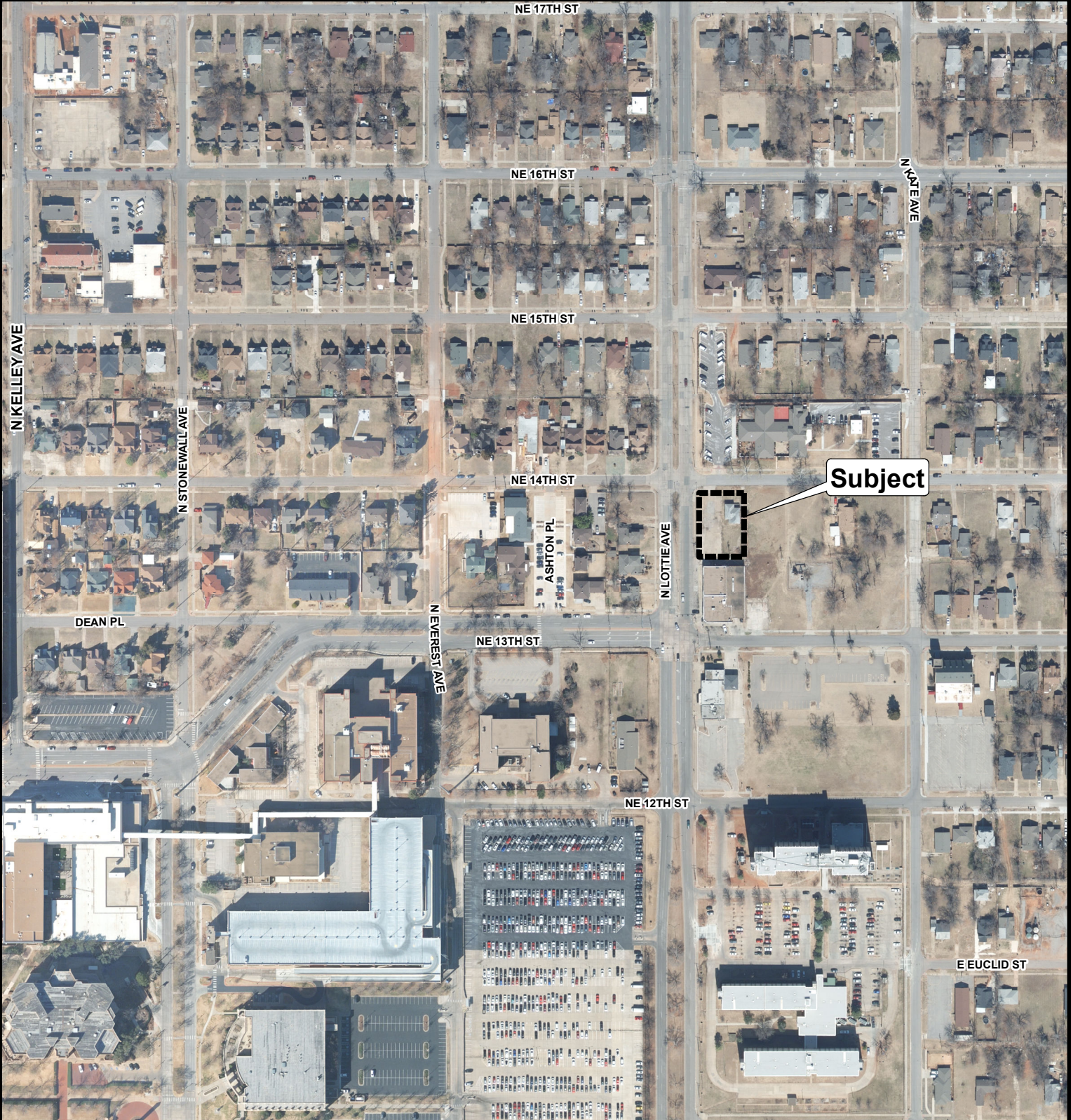
Aerial Photo from 2/2022

Case No: SPUD-1594 Applicant: Checkers Investments, Inc. Existing Zoning: R-1 Location: 1304 NE 14th St.